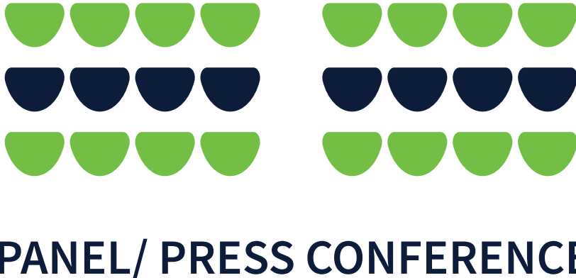
PANEL/ PRESS CONFERENCE